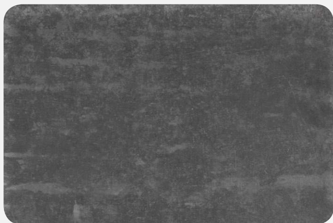
EuraZinc Pro Self weathering Zinc – Newly installed E-27-02-F-001188.00